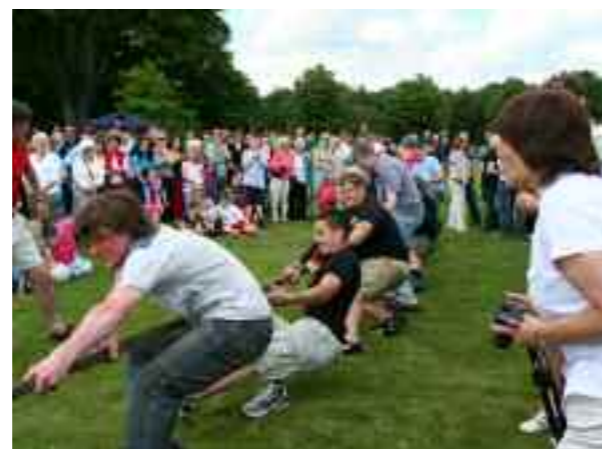
Church – 'Village Open Day'

– with a blessing for every part of the village