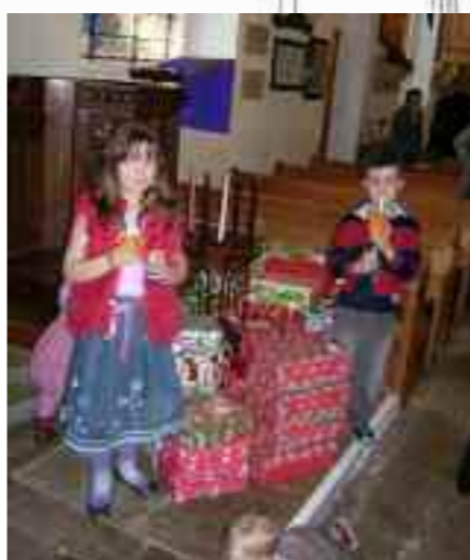
Operation Christmas Child