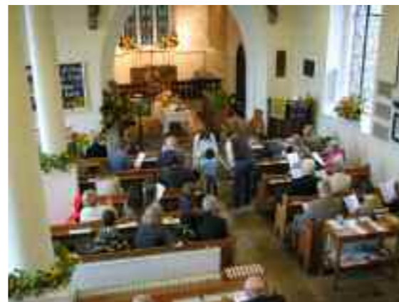
Family Service for Harvest

– new opportunities for worship and prayer